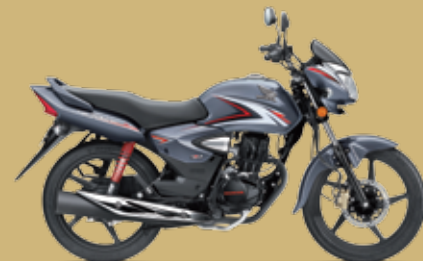
GENY GREY METALLIC