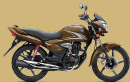
SUNSET BROWN METALLIC